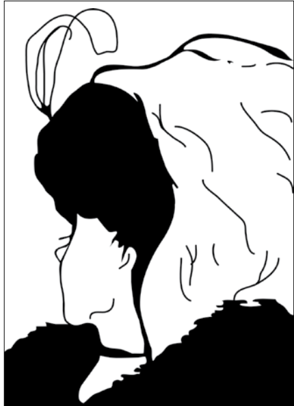
Figure 1. Told to look at the old woman’s large nose on the left, we tend to see only the old woman. Told to look at the young woman’s chin on the left, we tend to see only the young woman. In either case it can even be difficult to get our brains to switch to the other. This illustrates the power of suggestion or preconceptions. The picture also illustrates how one scientist looks at the data and sees an old earth, while another looks at the same data and sees a young earth. < www.grand-illusions.com/woman.htm >

This is a convenient re-characterization of the days, but it hardly cooperates with the author! 2