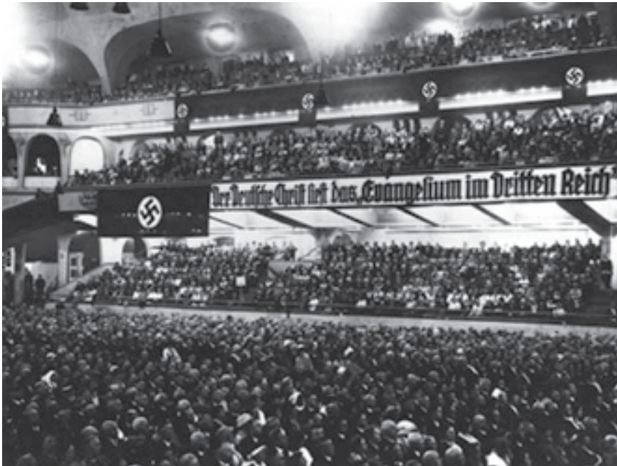
Figure 2. The so-called ‘German Christian Movement’ desired to achieve absolute organizational and ideological conformity between the Protestant church and the National Socialist state. The banner reads: The German Christian reads the ‘Gospel in the Third Reich’.

people. Christmas is the birth of our saviour: the spirit of heroism and the freedom of our people. Do you think these liberal priests, who have no longer a belief, only an office, will refuse to preach our God in their churches? I can guarantee that, just as they have made Haeckel and Darwin, Goethe and Stefan George the prophets of their ‘Christianity’, so they will replace the cross with our swastika [figure 2]. Instead of worshiping the blood of their quondam saviour, they will worship the pure blood of our people. They will receive the fruits of the German soil as a divine gift, and will eat it as a symbol of the eternal communion of the people, as they have hitherto eaten the body of their God. And when we have reached that point ... the churches will be crowded again. If we wish it, then it will be so—when it is our religion that is preached there. We need not hurry the process.’ 18