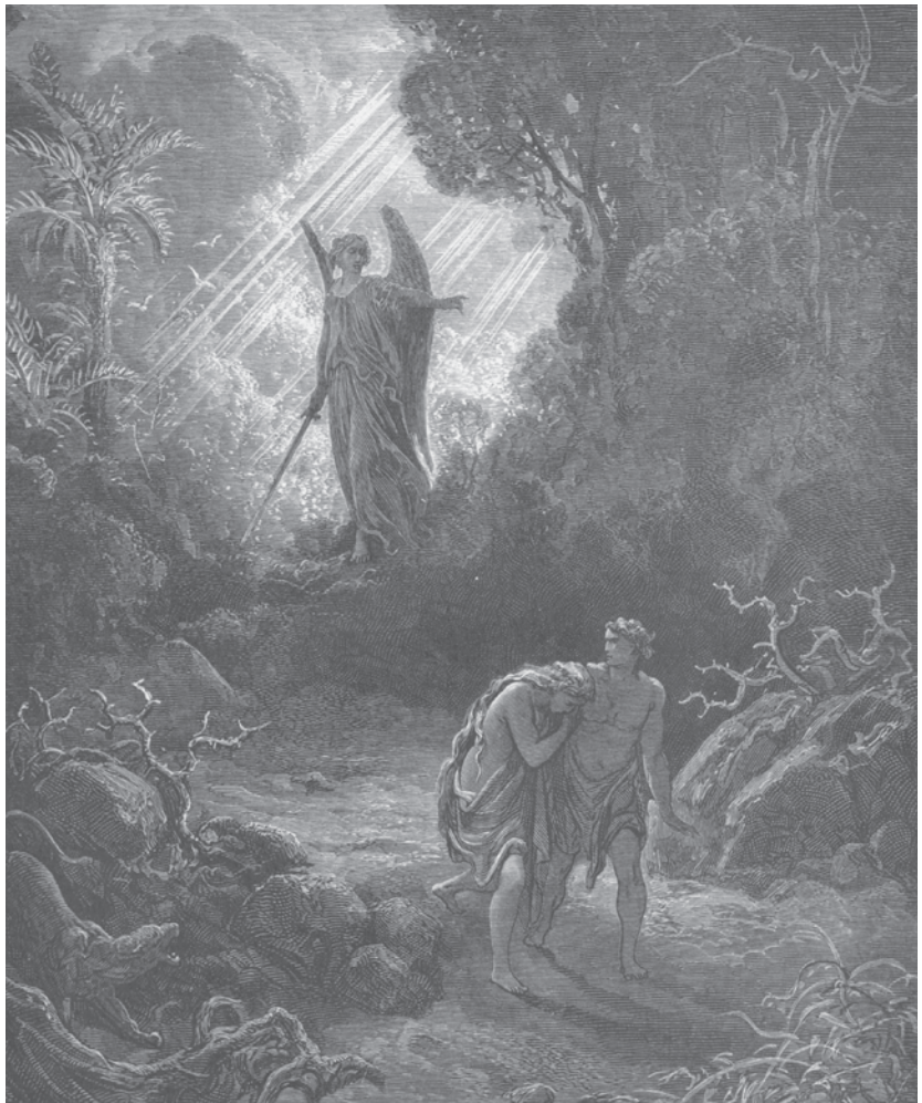
Sketch by Paul

for this reason. However, nowhere in Scripture is Eve ultimately blamed for the Fall. Uniformly, Adam is blamed for the introduction of death. In this passage, the sentence of death is pronounced to Adam, not Eve. It is Adam whom Paul contrasts with Christ; he argues that Christ's action brought life for all those under him just as Adam's, not Eve's, action brought death for all those under him (Romans 5:12 ff.<sup>4</sup>, 1 Corinthians 15:21–22, 45).