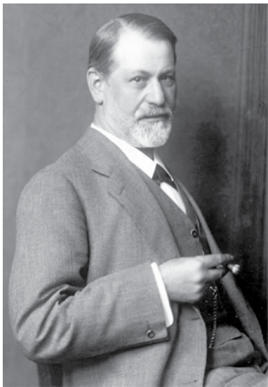
Figure 1. Sigmund Freud approaching middle age at the height of his career. In almost all of the many photos I have seen, including this one, he is holding a cigar. Freud died of suicide after suffering from a serious case of oral cancer that was likely caused by smoking.

a high sexual drive, to their progeny compared to animals that left fewer offspring. By this means, Darwinism argues, there was a selection for sexual drive strength, which caused sex to become the main drive in sexual animals. This conclusion is why the sex drive became central in Freud's theory of human behavior and is why his system is termed psychosexual theory , and the application of his theory is called psychosexual analysis or psychoanalysis . 19 Freudian concepts, such as libido, id,