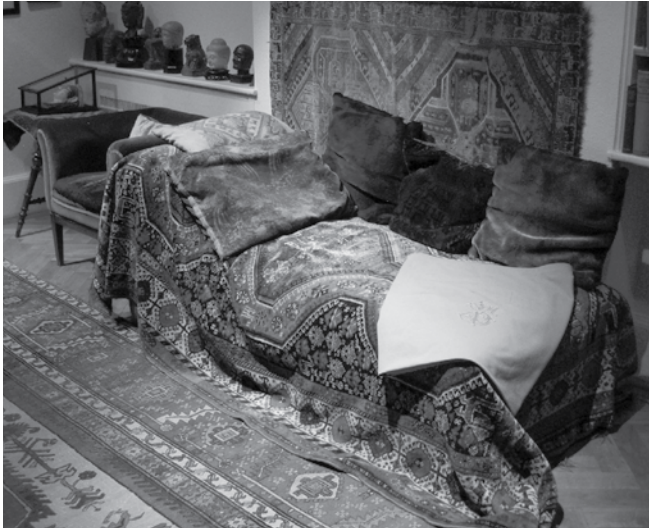
Figure 3. The famous couch that Freud used to psychoanalyze his patients. He sat in a chair to the left behind the patient so that his patients would not be distracted by his note taking. Freud felt the distraction would discourage them from speaking.

the Bible had a decisive influence on his intellectual and spiritual development.” 28