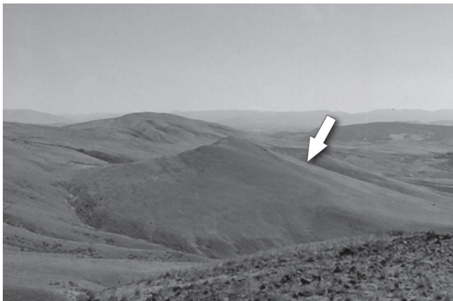
Figure 9. The south limb of the eroded anticline of the Rattlesnake Hills, southeast of Yakima, Washington, USA. The dip of the Columbia River Basalts and interbeds is shown by the smooth slope on the south side of the hogbacks (arrow). Extrapolating the dip of the hogbacks up to the axis of the anticline (left) shows that about 300 m of basalt and interbedded sediments were eroded from the top of the anticline.