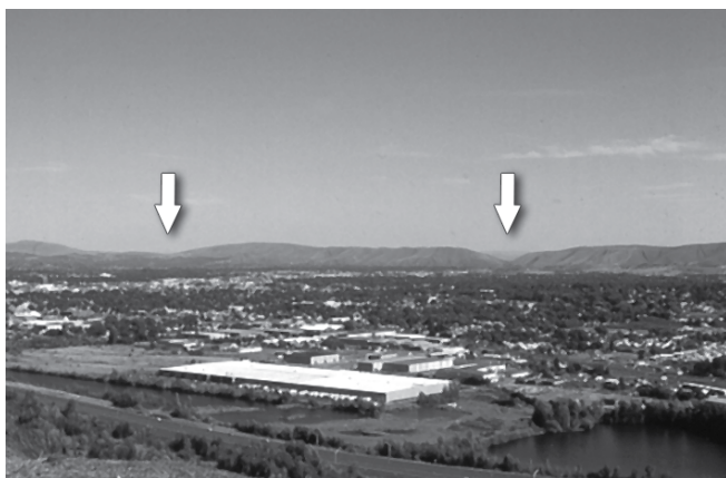
Figure 10. Union water gap (right arrow) on the Yakima River, just south of Yakima, Washington, USA, between Antanum Ridge to the west (right) and the Rattlesnake Hills to the east (left) of the water gap (view southeast). Antanum Ridge/Rattlesnake Hills is a basalt anticline of the Columbia River Basalts. Konnowac Pass (left arrow) is a wind gap through the Rattlesnake Hills.

Massive water currents also are indicated by eroded basalt anticlines in the southwest CRB. The Rattlesnake Hills shows evidence that more than 300 m of rock was beveled off its top (figure 9). Rounded quartzite cobbles and boulders, transported from western Montana or Idaho are found overlying this erosional surface, again more consistent with the retreating Floodwater than with any post-Flood process.