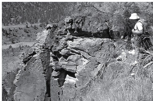
Figure 5. Rattlesnake Formation welded tuff, north of Dayville, north-central Oregon, USA.

Austin's reasons for a post-Flood emplacement are equivocal; he argued that basalts in the area had to be post-Flood because they exhibit subaerial features, such as columnar joints, widespread flow, and a lack of pillow structures. 10 But none of these are conclusively diagnostic of a subaerial environment. Pillows, as observed when lava is emplaced on the sea floor, can be absent if the extrusion is rapid. 13 And pillow lava is common in the CRB, especially at the edges of flows where the lava slowed (figure 4). 14