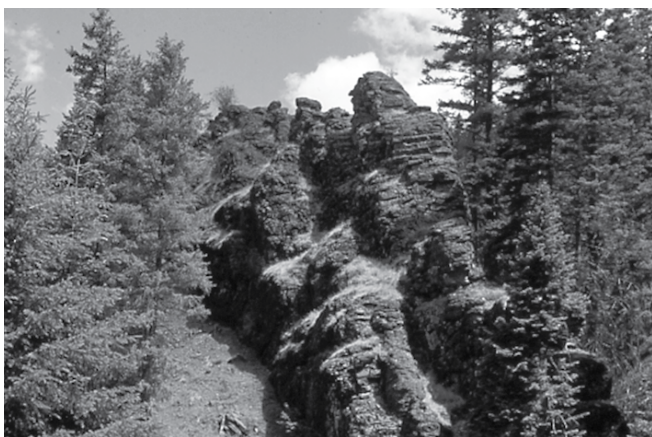
Figure 3. Dike from which the Columbia River Basalts erupted, west of Cottonwood Creek, John Day Country, north-central Oregon, USA.