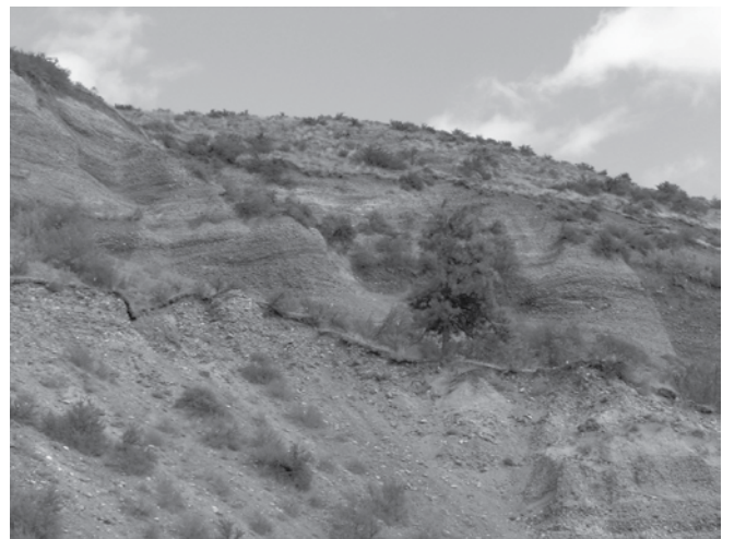
Figure 8. The Thorp Gravel in a 75-m-high terrace in the western Kittitas Valley about 15 km west of Ellensburg, Washington, USA. The gravel consists entirely of volcanic cobbles and boulders shed from the Cascade Mountains to the west.

Another compelling evidence is the presence of a white diatomite layer locally sandwiched between black basalt flows. It can be seen south of Quincy and east of Ellensburg, Washington, where its 6-m thickness is mined (figure 7). Being nearly pure, with little clay or other impurities, makes it not only commercial, but also strongly suggests that it could not have formed over a number of years in a post-Flood lake.