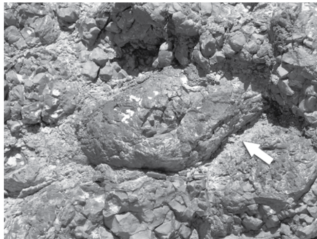
Figure 4. Pillow lava from the Columbia River Basalts, Washington, USA. The yellow material between the pillows (arrow) is palagonite, which forms when hot lava moves slowly into water and shatters.

At one time I agreed, 11 convinced by Austin's research. But being from Washington State, I was able to examine much of the geology first hand. That revealed overwhelming, obvious evidence that the CRB were deposited during the Flood. 12