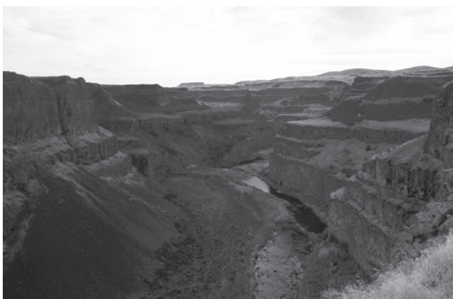
Figure 2. The Columbia River Basalts at Palouse Falls, southeast Washington, USA.