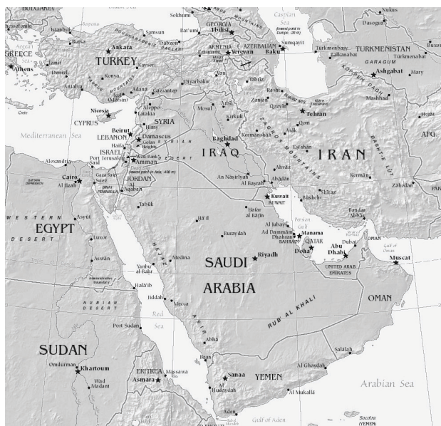
Figure 1. Modern map of the Middle-East used in QSQE .

However, the world has a curved surface, and longitudinal lines grow wider apart the nearer to the equator one travels. Does the QSQE author understand how using longitudinal references affects his case?