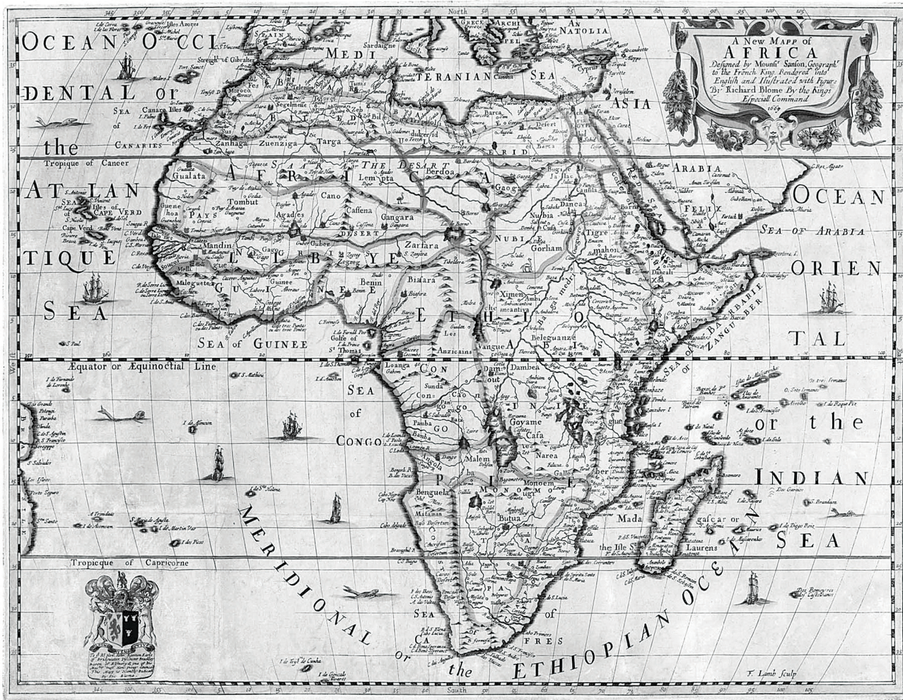
Figure 3. Map of Africa, 1669, by Richard Blome.

sources, but they are studied with considerable caution, and conclusions are primarily based on the more ancient sources. So, the general rule among scholars is that acceptance of any such details from the later classical sources must be deferred unless they are confirmed by the more ancient evidence. Thus Josephus' reference to the queen of Egypt and Ethiopia may be considered a reasonable substitution for the biblical 'Queen of Sheba' only when a contemporary record covering this matter supports it. For supporters of the VIC, this is bad news; there is no such record. But there is more. The region now known as Ethiopia was the probable location for Punt, a land with which Egypt eventually had trading interests. But the VIC needs to have Punt be, instead, Israel—to the north. " 22