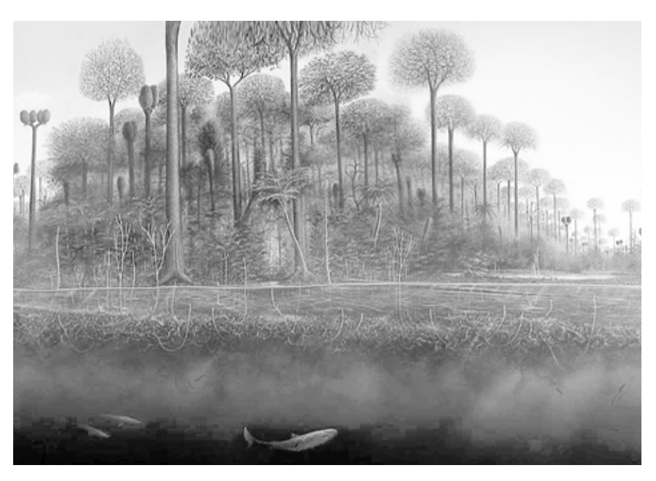
Figure 2. Diagrammatic representation of a floating forest. Used with permission of Answers Magazine<sup>2</sup>

Snelling has used the floating forest model to explain coal cyclothem deposits in the Paleozoic.<sup>23</sup> He suggested that the main cores of the floating forest biome were destroyed early in the Flood, but did not give a specific timeframe, resulting in toppled lycopod trees that floated temporarily on the surface. He proposed that as the floating debris and logs became progressively water-logged, sinking a few at a time,